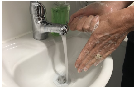
4. Rub both thumbs with a twisting action.