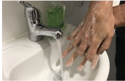
2. Rub backs of both hands and between fingers.