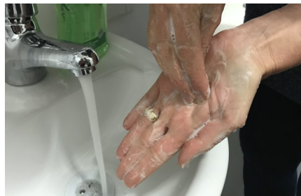
6. Rub both palms with finger tips.