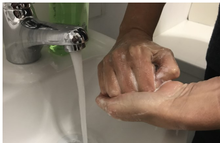
5. Link hands and rub backs of fingers in palms.