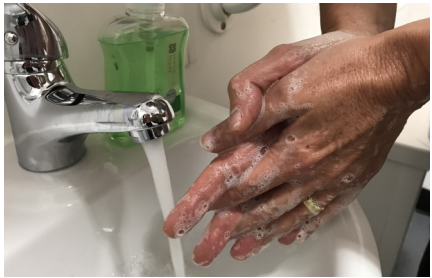
3. Rub hands palm to palm and between fingers.