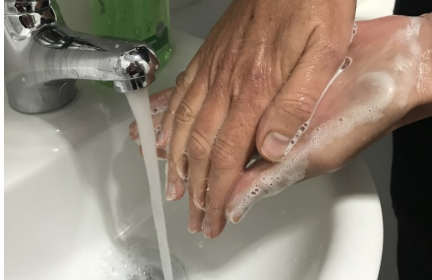
1. Rub hands palm to palm with a circular action.

Wet your hands under warm running water, apply liquid soap and wash hands for 20 seconds, following the six steps below. Then you should rinse your hands under warm running water and dry thoroughly with a clean towel.